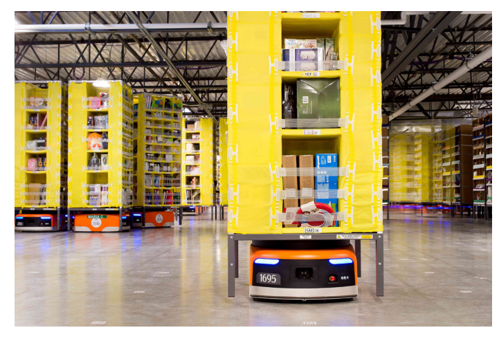
Mobile automation: Autonomous Mobile Robots (AMRs), Automated Guided Vehicles (AGVs)

High costs and long payback periods. Many traditional forms of automation are heavily customized for specific uses, which both drives up initial costs and limits secondary use. In addition, the low