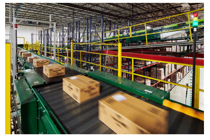
Partial fixed automation: Conveyors, palletizers, pallet shuttles, vertical lifts